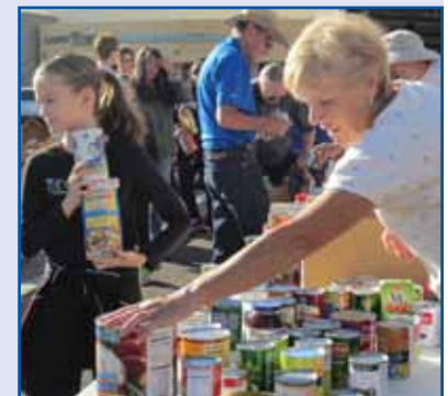
Community Collection Day: November 16

Before Thanksgiving and through the holidays, lines at the ICS Food Bank stretch around the building and demand peaks. The Bag-A-Thon, our single largest food collection event, is essential to ensuring that ICS has enough supplies to fill holiday food bags and keep our shelves stocked to meet the need. This year, we expect to distribute more than 2,500 holiday food bags.