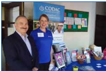
Over 20 local agencies and organizations provided information at the conference’s resource fair.