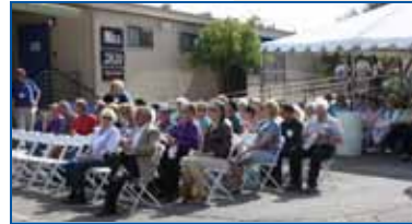
Guests celebrated the ICS Food Bank with ice cream and music.