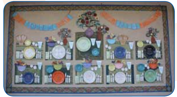
Tiles designed by Santa Theresa Tile Works brighten the ICS Food Bank's "Table of Plenty" donor tile wall.

The afternoon's activities included a ribbon-cutting ceremony with the Tucson Metropolitan Chamber of Commerce and a dedication ceremony to recognize the businesses, foundations, faith communities, and individuals who donated to the project. Many of those who contributed stopped by to find their name on the donor tile wall—a colorful "Table of Plenty" on the front of the new building that shows the Food Bank was a true community effort. The ice cream social was sponsored by Mutual of Omaha Bank and Tucson Electric Power . Visit www.icstucson.org to see more photos of the day's festivities.