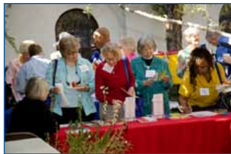
The campus of St. Philip’s In The Hills Episcopal Church was a perfect setting for the day’s events.