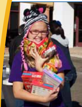
A young volunteer sorting food at last year’s Bag-A-Thon.

The 6th annual Edward Jones “Bag-A-Thon” food drive to support the ICS Food Bank runs October 3 to November 3, 2012. The Bag-A-Thon is essential to ensuring ICS has supplies to meet the need for food during the holiday season. In 2011 ICS provided holiday food bags to nearly 2,000 households; we expect that number to rise significantly this year.