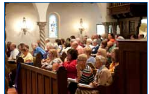
Participants took home a wealth of information from the day’s speakers and workshops.

A BIG thanks to our major funder: The David C. and Lura M. Lovell Foundation .