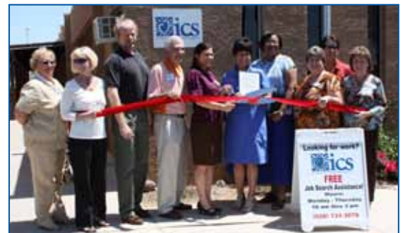
The Tucson Metropolitan Chamber of Commerce helped ICS celebrate with a ribbon-cutting ceremony.

In collaboration with Arizona Youth Partnership's "Building Futures for Families" program, the ICS Resource Centers also offer access to free classes on family communication and relationship-building. A partnership with Wells Fargo Hands on Banking® provides help with financial literacy skills such as household budgeting and money management.