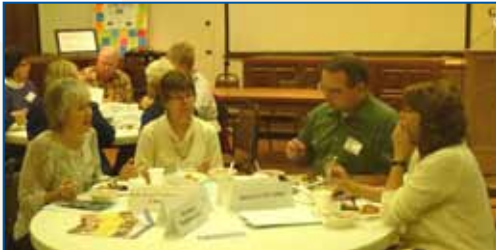
Congregational representatives share a meal before a recent ICS Council meeting.

Many thanks to all our partner congregations for putting faith into action! To schedule a visit to ICS, to have ICS staff speak to your congregation, or to explore how your congregation can join ICS in the good work described in this newsletter, call us at 297.6049.